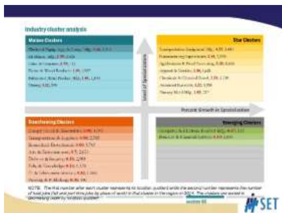
ii: Industry Cluster Analysis (click image for data packet)